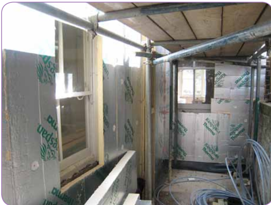
A home undergoing retrofit

In general terms the retrofit strategies used by the sample R4tF Project Teams fell into one of four approaches outlined below. It is fairly well accepted that "fabric first" is the most effective strategy for retrofit and those identified below all followed variations on this approach.