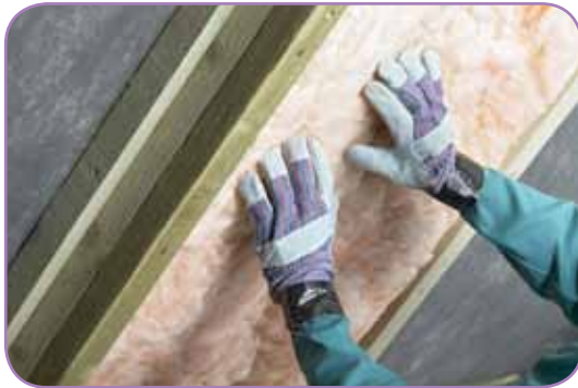
A home being insulated